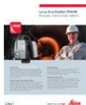
Leica ScanStation P30/40

Illustrations, descriptions and technical specifications are not binding. All rights reserved. Printed in Switzerland – Copyright Leica Geosystems AG, Heerbrugg, Switzerland 2015. 835467en-us – 03.15 – INT