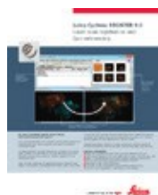
Leica Cyclone REGISTER